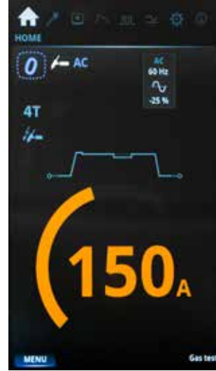
MTP35X (Std fit on MT535)