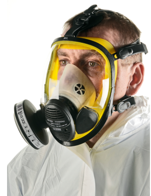
Figure 3 Full-face mask