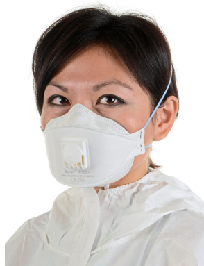
Figure 1 Disposable half mask

Examples of types of tight-fitting facepieces are shown in Figures 1, 2 and 3.