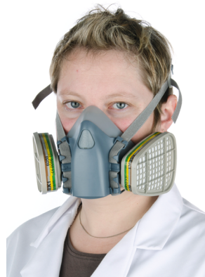
Figure 2 Reusable half mask