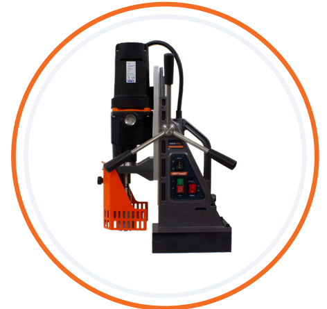
Metal guard system supplied as part of a comprehensive kit package