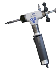
BRB 2 Electric with clamping system "Standard"

The technical data are not binding. They are not warranted characteristics and are subject to change. Please consult our general conditions of supply.