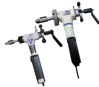
BRB 2 and BRB 4 Electric with clamping system "NC"