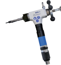
BRB 2 Pneumatic with clamping system "Standard"