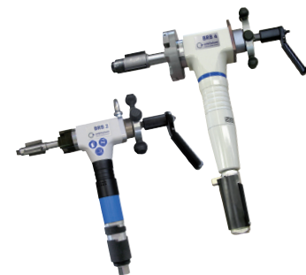
BRB 2 and BRB 4 Pneumatic with clamping system "NC"