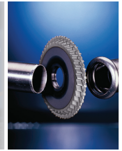
Square, burr-free and deformation-free pipe end - ideal for pressfitting applications