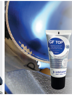
Saw blade lubricant GF TOP included