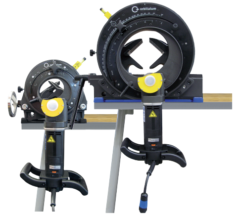
GFX 3.0, GFX 6.6