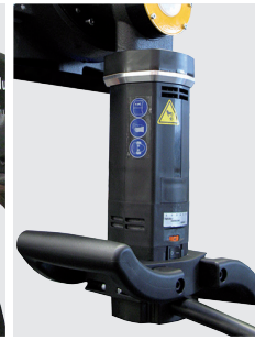
Powerful drive with electronic overload protection and ergonomically designed motor handle