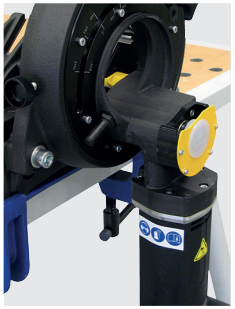
Second saw blade position to cut off elbows