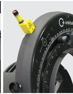
Integrated line laser to determine the cut off point