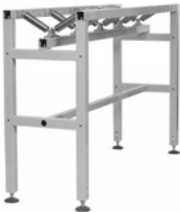
Pipe feeder extension unit

To extend the the base unit, can be used singularly or in multiples, easily bolted together.