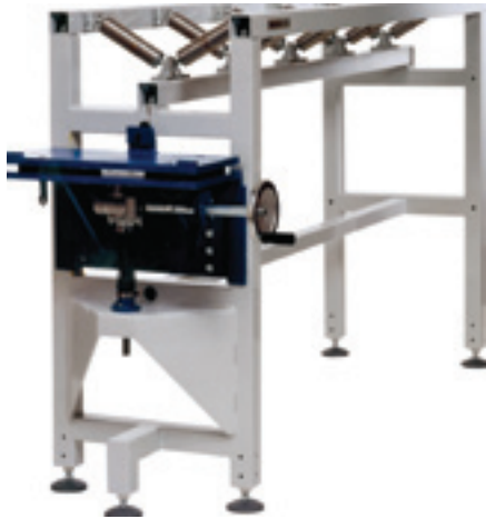
Pipe feeder base unit

Fits all pipe cutting and beveling machines in the GF and RA series from Orbitalum Tools (except the RA 21 S and GF 20 AVM. RA 2, GFX 3.0, PS 4.5 and PS 6.6 on request). The machines can be directly mounted onto the base plate of the pipe feeder base unit, without further parts. The machines can be easily adjusted to the required cutting dimension using the handwheel-operated mechanical height adjustment. The machine is securely fastened to the base plate.