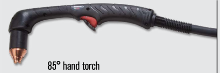
85° hand torch

Duramax Hyamp standard torch styles (for more torch options, see www.hypertherm.com )