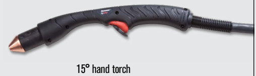
15° hand torch