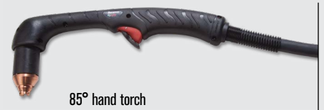
85° hand torch

Duramax® Hyamp™ standard torch styles (for more torch options, see www.hypertherm.com )