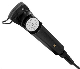
MMA 3 Traditional remote for amperage adjustment