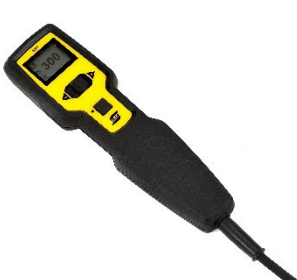
ER 1 Multi-functional remote with built-in display